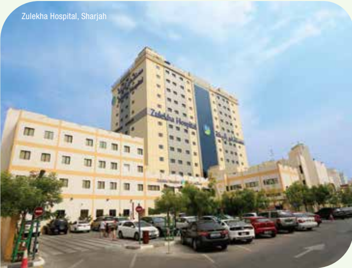
Zulekha Hospital, Sharjah