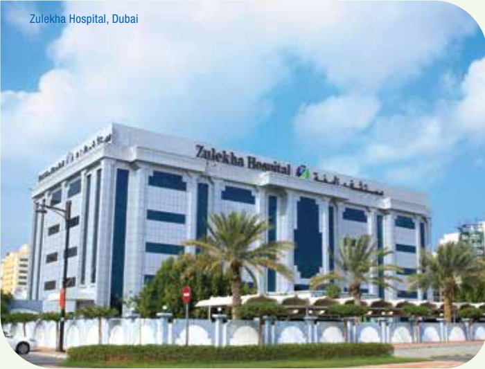
Zulekha Hospital, Dubai